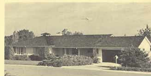
RANCH STYLE HOME IN A SAN FRANCISCO SUBURB.

Aunt Ann's usually can obtain jobs for your friends or relations with employers close enough for you to visit on your days off.