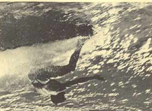
SURFING IN SANTA CRUZ IS FUN! San Franciscans can surf, water or snow ski, swim, sail, fish or hunt within a 5-minute to 2-hour drive from home. (to watch at least)